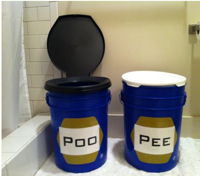
Twin-Bucket Toilet System

Recent earthquakes in New Zealand left 50,000 people without a functioning sewer system and unable to flush toilets for years. People adopted and relied on the twin-bucket toilets system during the emergency stage of the crisis.